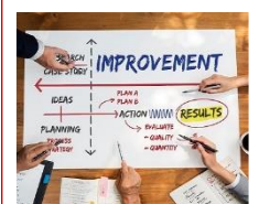
Manage Business Improvement