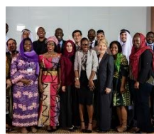
Manage Equality and Diversity