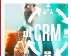
Manage Customer Relations