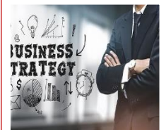
Develop Business Strategy