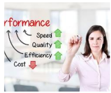
Managing for Performance