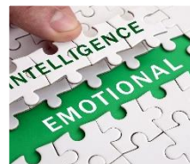
Emotional Intelligence for Leaders