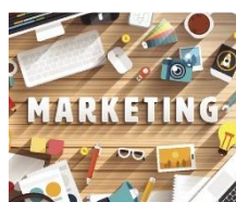
Manage a Marketing Program