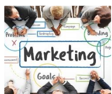
Develop Marketing Strategy