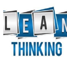
Plan LEAN Improvement