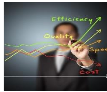
Efficiency and Effectiveness