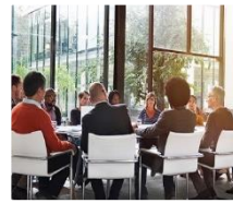
Understand the Organization