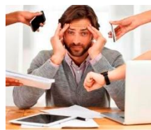
Managing Stress and Conflict