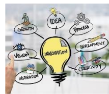
Develop a Culture to Support Innovation