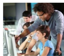
Create a Learning Organization