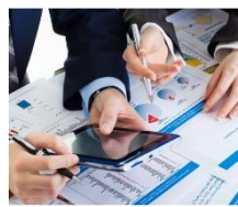
Making a financial Case