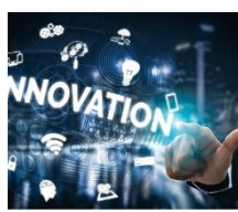
Lead Innovation and Entrepreneurship