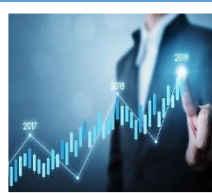
Develop Operational Excellence