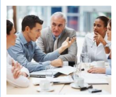
Leading Organizational Change