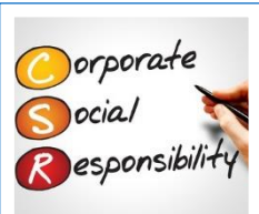
Corporate Social Responsibility