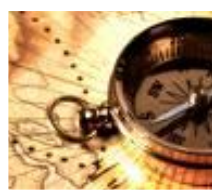
Develop Strategic Plans