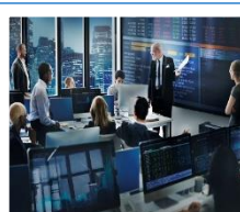
Finance for Strategic Managers