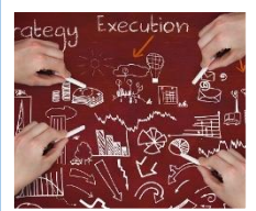
Lead Strategy Implementation