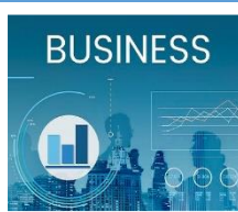
Review Business Performance