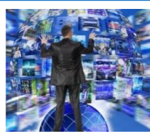
Strategic Marketing Management