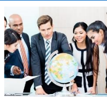
Develop International Business