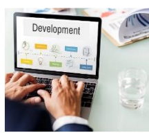
Personal Development for Leadership