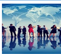
The International Business Environment