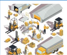
Logistics and Supply Chain Management