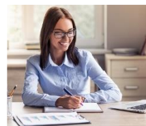
Writing for Business