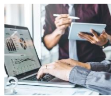
Develop Business Budgets