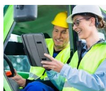
Materials and Equipment