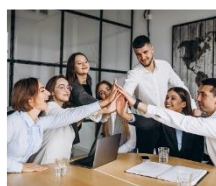
Motivating for Performance