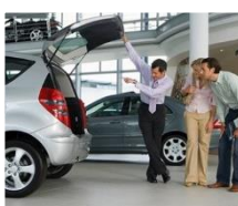
Essential Sales Skills