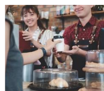
Customer Service Essentials