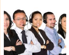
Manage a Sales Campaign