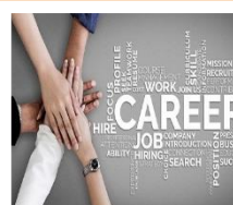
Develop your Career