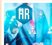
Foundations in H-R-M