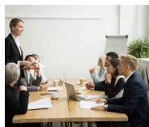
Run Team Meetings