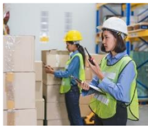
Foundations in Management