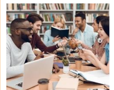
Manage Workplace Relationships