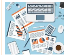
Writing Business Reports