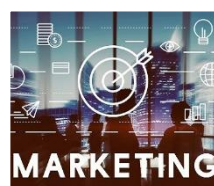
Foundations in Marketing