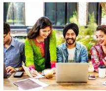
Building an Effective Team