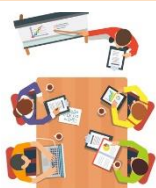
Training and Induction